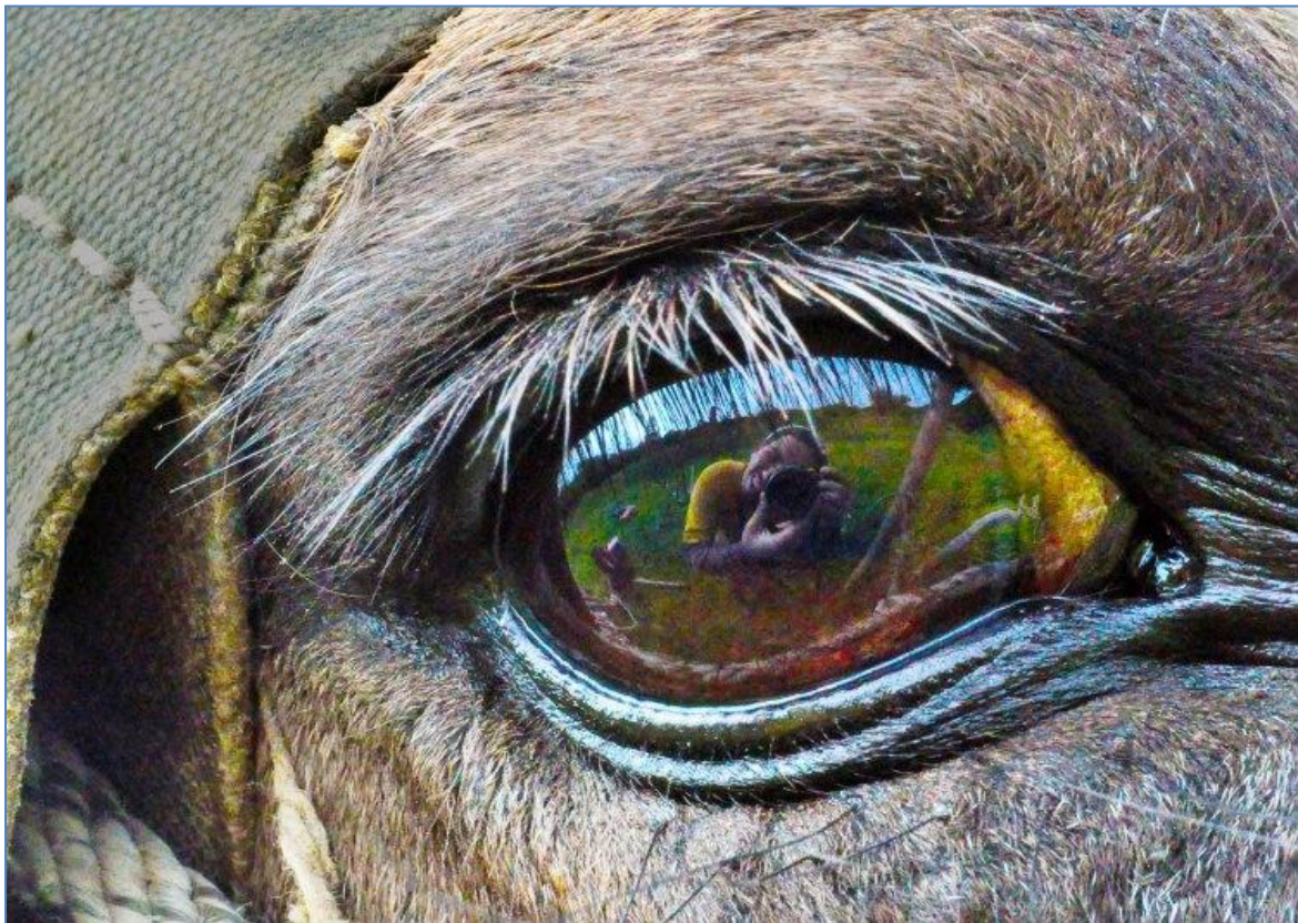
'Rural Eye' by CLP alum Aldemar Acevedo