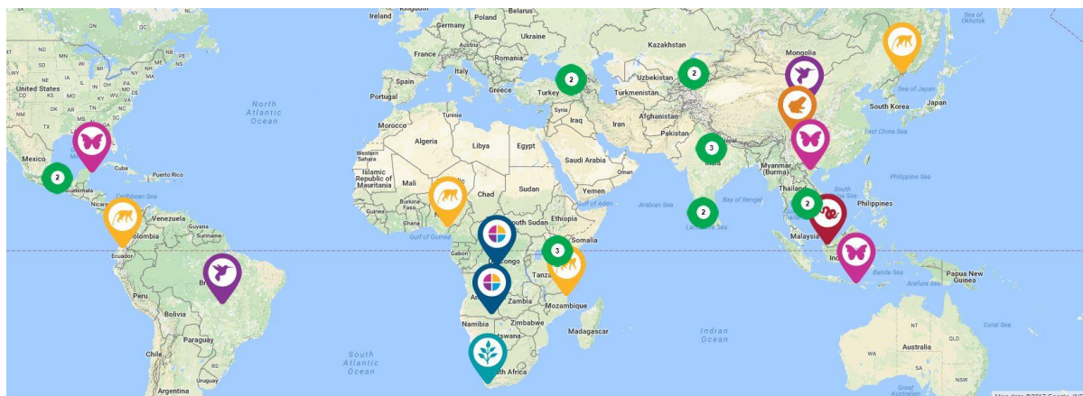
Locations of 2016 projects and internships ( www.conservationleadershipprogramme.org/our-projects/project-map )

CLP selects exceptional teams of early-career conservationists that are granted project funding through our Conservation Awards. There are three grant levels, which allow teams to scale up their initial projects over time. In 2016, CLP granted 18 awards worth a total of $264,650, comprising 15 Future Conservationist Awards, two Conservation Follow-Up Awards and one Conservation Leadership Award. For more information about each project, including project abstracts and final reports, please visit the CLP website.