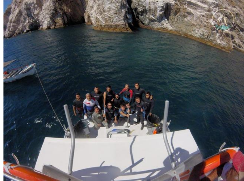
Figure 6 Fishers from BK, ISPN and PL during monitoring and experience exchange at ISPN.