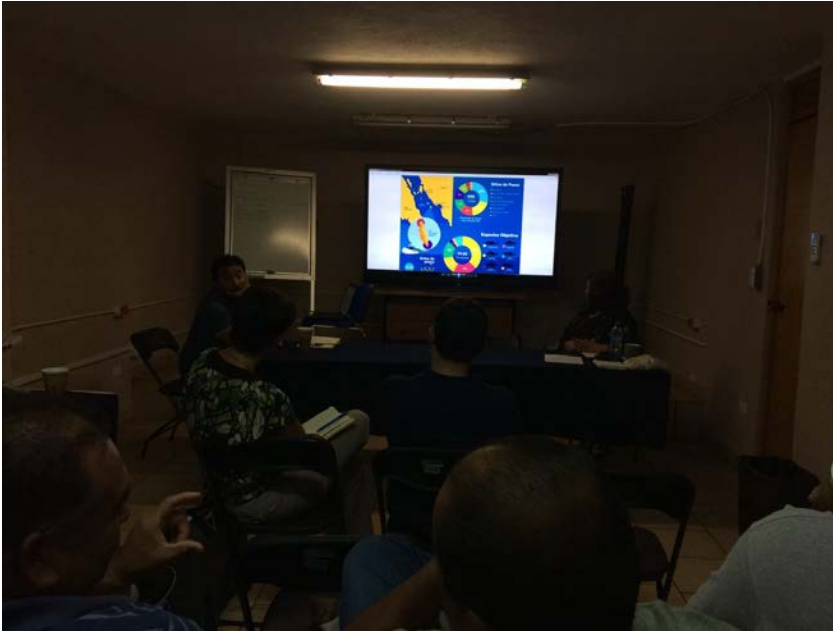
Figure 13. Presenting finfish logbook program results to stakeholders in Guaymas (July 2018).