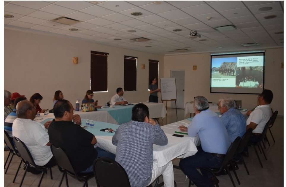
Figure 14. Presenting finfish logbook program results to stakeholders in Guaymas (July 2018).