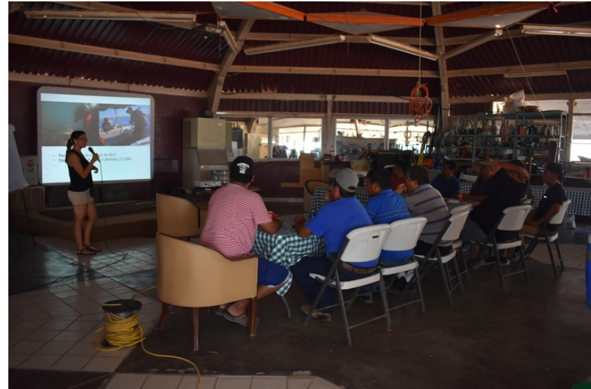
Figure 12. Presenting monitoring results to PL fishers (July 2018).