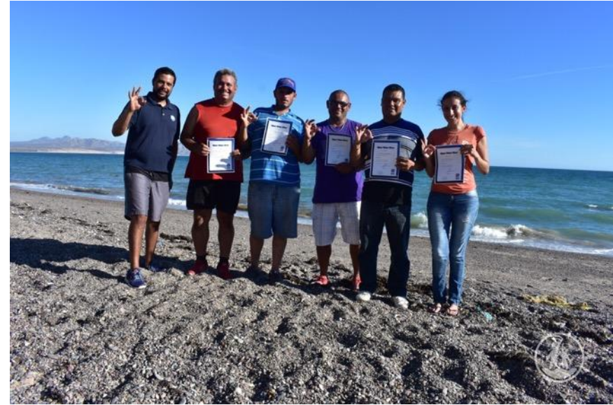
Figure 2 Four fishers from PL are certified as PADI Open Water Divers.