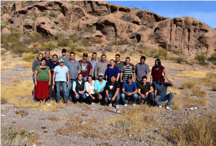
Figure 9 Fishers trained in small-scale fishing monitoring during a workshop in Guaymas (December 2017).