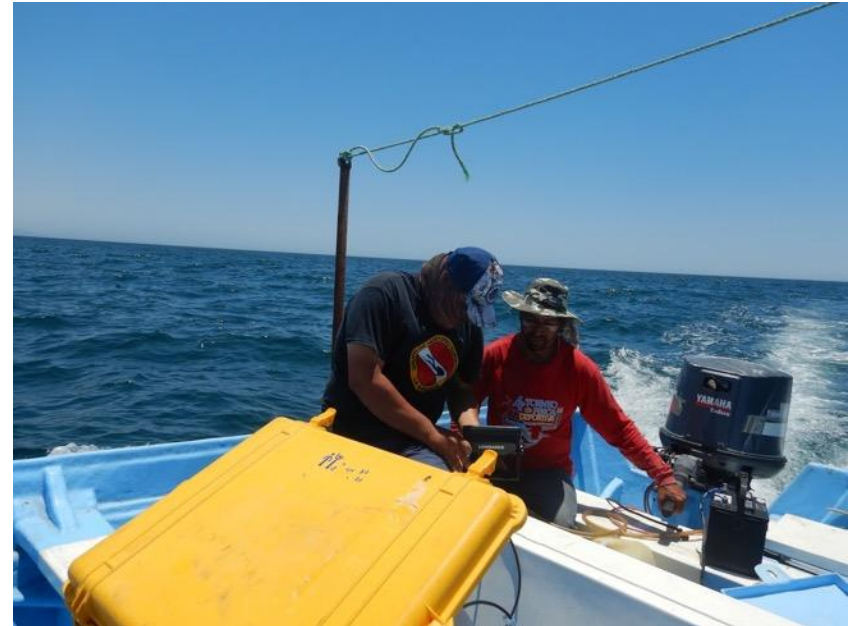
Figure 8. Our team and fisher checking the side scan sonar during a bathymetric study of PL bay.