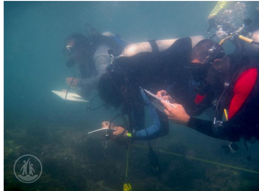
Figure 4 Species (fish and invertebrate) identification test following a 30 meter transect.